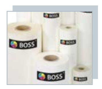
BOSS FILM SUPPLIES

Vivid design and manufacture a wide range of laminating systems, specialising in function, style and reliability.