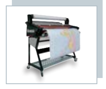
LINEA ENCAPSULATION SYSTEMS