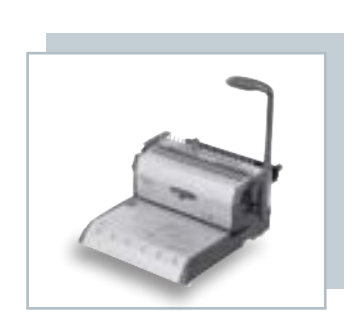
MAGNUM BINDING SYSTEMS