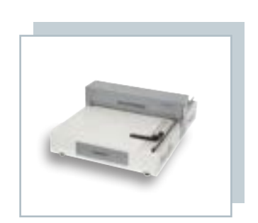
MAGNUM CREASING SYSTEMS