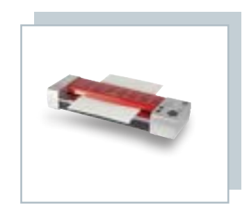
PEAK POUCH LAMINATING SYSTEMS