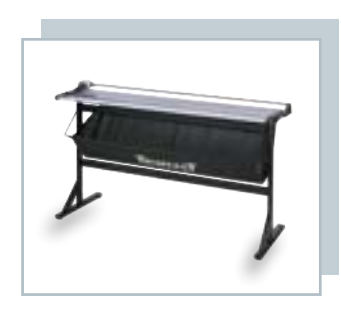
TRIMFAST TRIMMING & CUTTING SYSTEMS