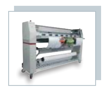
EASYMOUNT WIDE FORMAT SYSTEMS