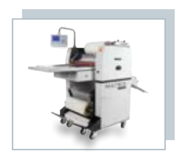
MATRIX LAMINATING SYSTEMS