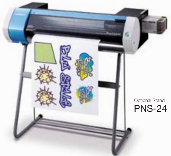
Optional Stand PNS-24