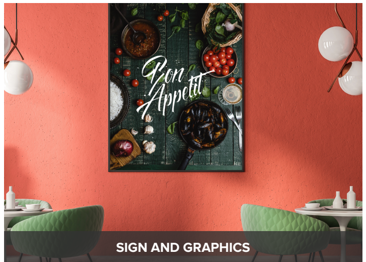
SIGN AND GRAPHICS