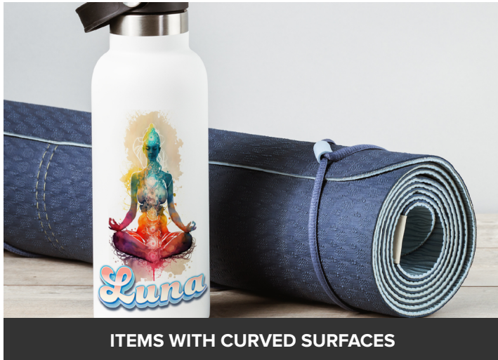
ITEMS WITH CURVED SURFACES