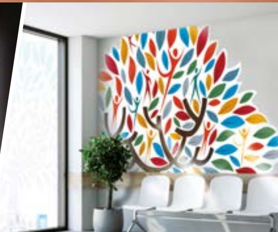
WINDOW AND WALL GRAPHICS