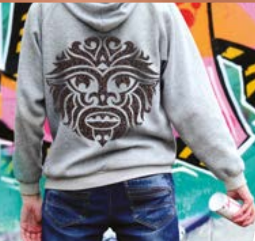
HEAT TRANSFER APPAREL