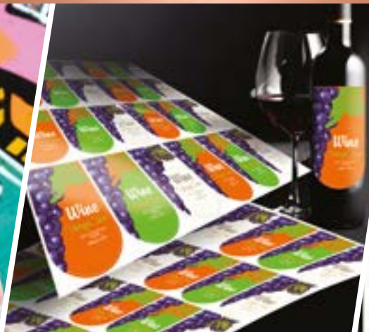
CONTOUR CUT LABELS