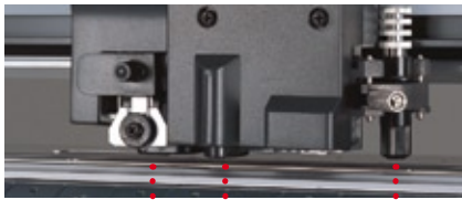
Automatic sheet cutter Light pointer Swivel cutter

Media can be automatically cut by a standard sheet cutter.