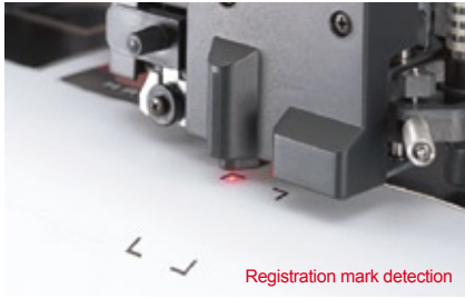
Registration mark detection