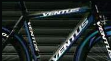
Decorating racing bicycle with decals