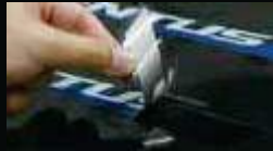
For short-run production of labels and stickers

Roland's renowned integrated Print & Cut technology offers the power and versatility your business demands. It prints and then automatically contour cuts images into any shape in one seamless workflow. With the XR-640, you can create a variety of custom applications quickly, easily and profitably, including POP, floor signage, stickers, vehicle decals and apparel heat transfers.