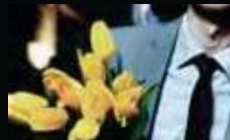
Printed with a conventional model

Roland print technology achieves stunning, vibrant colour quality by maximising the performance of new dual print heads and ECO-SOL MAX2 ink