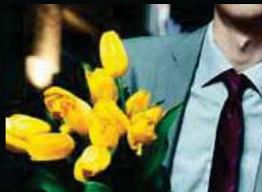
Printed with the SOLJET PR04 XR-640